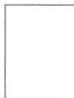
Folded in half